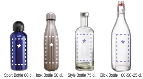
Sport Bottle 60 cl. Inox Bottle 50 cl. Style Bottle 75 cl. Click Bottle 100-50-25 cl.