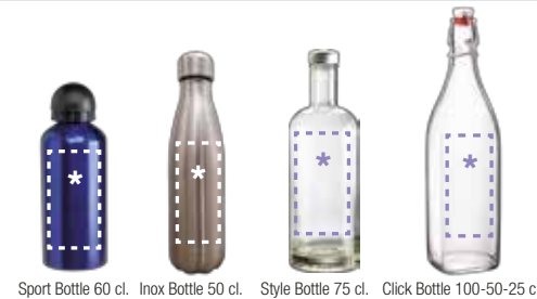
Sport Bottle 60 cl. Inox Bottle 50 cl. Style Bottle 75 cl. Click Bottle 100-50-25 cl.