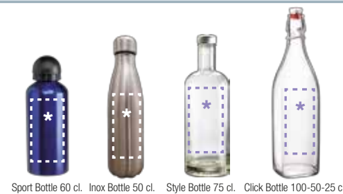
Sport Bottle 60 cl. Inox Bottle 50 cl. Style Bottle 75 cl. Click Bottle 100-50-25 cl.