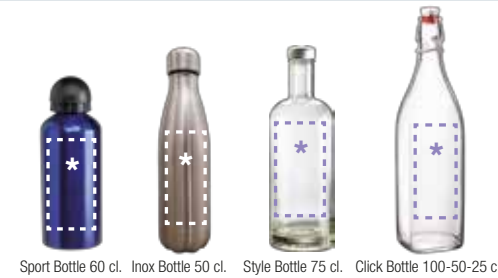
Sport Bottle 60 cl. Inox Bottle 50 cl. Style Bottle 75 cl. Click Bottle 100-50-25 cl.